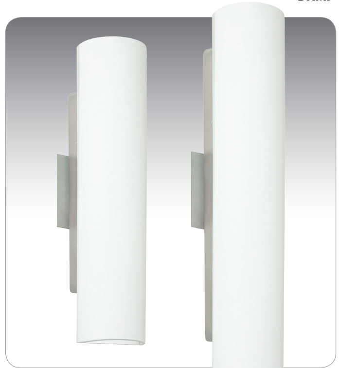
DARCI 16 SHOWN IN OPAL MATTE (272507) & DARCI 21 SHOWN IN OPAL MATTE (272607)

UL or ETL Listed. Suitable for Damp Locations (interior use only).